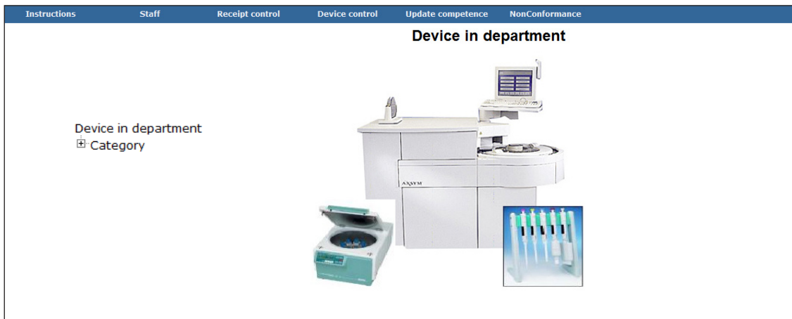
Equipment in the HIV- Hepatitis laboratory